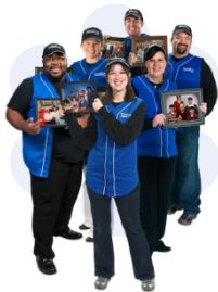
Hamilton Relay Outreach Team